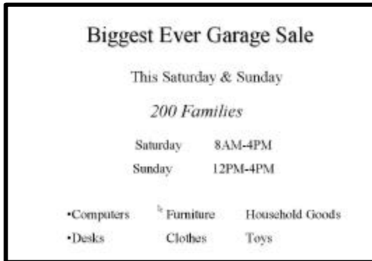
Sample Text Panel