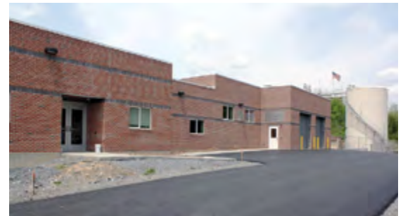
Control Building, left; Maintenance Building, center; and Garage, right

The Borough's Wastewater Treatment Plant project, which began in October of 2012, is due for final completion by the end of July. The project included a phosphorous removal system with a bulk chemical storage building; a UV disinfection system which replaces the gas chlorine disinfection system; an enclosure over the screenings removal system; a new larger diameter outfall pipe for discharge into the Sacony Creek; and the demolition and replacement of the original Wastewater Treatment Plant control building that was constructed in 1939.