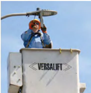
Lineman Kerry Eckert installing an LED street light head.

In 2013, the Borough Electric Department began replacing 150 watt High Pressure Sodium street light heads and 175 watt Mercury Vapor street light heads with energy efficient 65 watt LED bulbs on Sacony Alley, Sander Alley and West Walnut Street. So far, in 2014, the 49 area lights in the park have been replaced with LED bulbs, which lowered the energy used per light pole from 175 watts to 40 watts. Other targeted areas for LED replacements this year are West Main Street, from College Boulevard to Constitution Boulevard, as well as Noble Street and South Whiteoak Street.