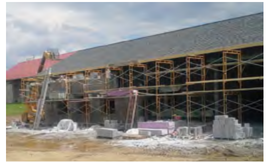
Water Treatment Plant Building Expansion

On the same site, the Nitrate Removal System project is an upgrade that will enable the removal of nitrates from the well water that supplies the Water Treatment Plant.