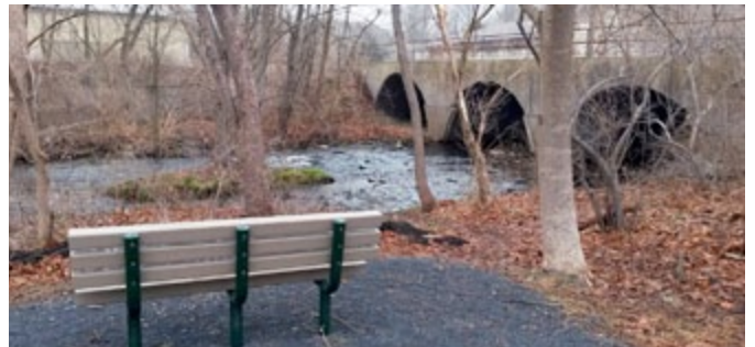
A scenic view from a bench overlooking the creek and bridge in North Park.

than 90 minutes in the last six months. LED street lights have already been installed on College Boulevard and Noble Street as well as portions of East and West Main Streets, Normal Avenue, South Baldy Street and South Whiteoak Street. This summer, the Electric Department will install five more decorative street lights on West Main Street between Strausser Alley and Noble Street.