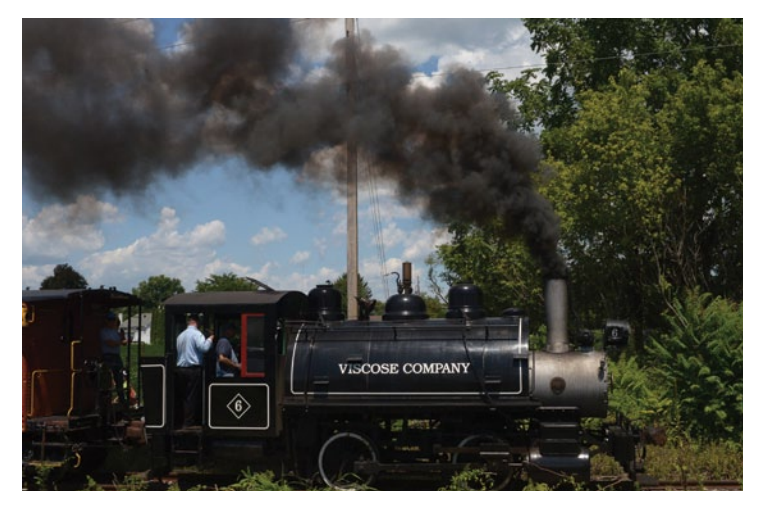
The Allentown & Auburn Railroad steam engine was very popular during the celebration.