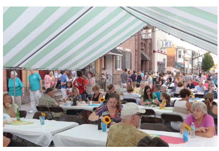
Dinner on Main was the best place to see old friends and make new ones.