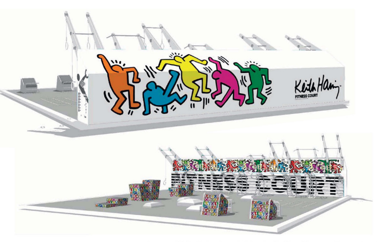
Approved Keith Haring Artwork Selection for City of Kutztown Fitness Court