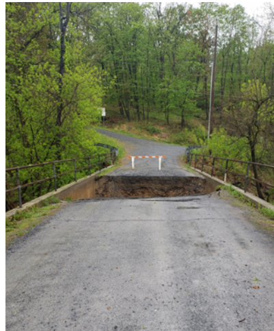
Since last year, the bridge was impassable

The North Park Bridge was originally built in the late 1970s, and over the last few years, the structure began to fail. In the spring of 2022, the bridge collapsed, forcing the Borough to close access for about a year. Through emergency permits, the collaboration between the Borough and the Maxatawny Township Municipal Authority, the efforts of Dessco Design & Construction, Inc., and the hard work of Borough crews, the new and improved 50-ton bridge reopened in April. It took many meetings and agreements between the Borough and the Maxatawny Township Municipal Authority to see this long-term one-million-dollar investment come to fruition, but the collaboration has resulted in a safe, scenic, and successful bridge replacement.