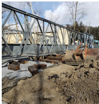
New bridge being installed