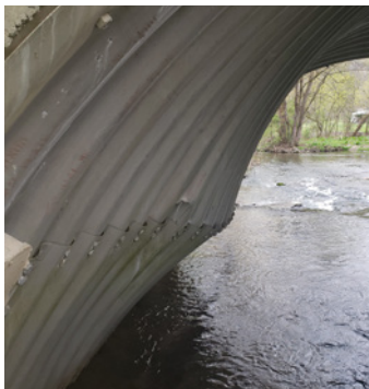
Collapsed bridge in 2022