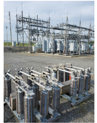
High Voltage Manual Switch