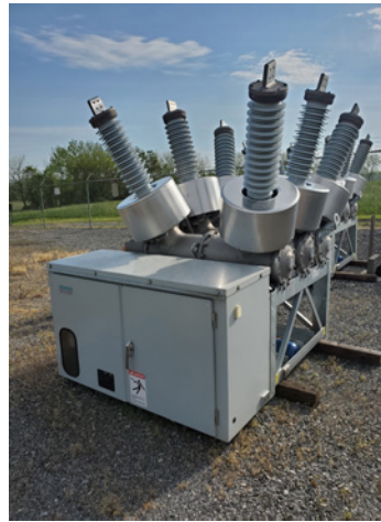
High Voltage Circuit Breaker

New high voltage circuit breakers and manual switches will be installed this fall, at the Borough's 69 KV substation, by the Borough's Electric Crew. They will be set up and tested by the Borough's electrical engineers before going into service. A recycling contractor will be used to remove the old oil-filled breakers.